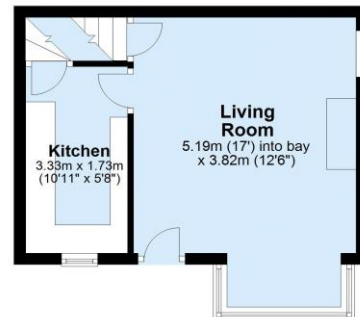
Second Floor Approx. 18.8 sq. metres (202.4 sq. feet)