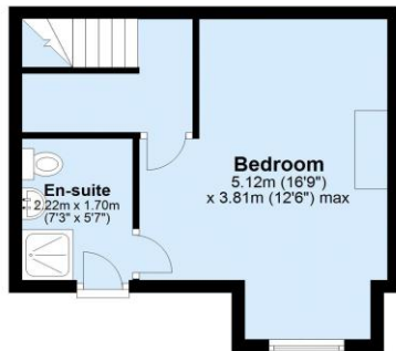
First Floor Approx. 24.2 sq. metres (260.2 sq. feet)